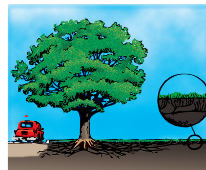
Fine, water-absorbing tree and grass roots are in top 6 inches (15 cm) of soil.